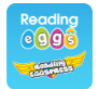
Edmentum - ReadingEggs

You must ALWAYS log in through Clever first.